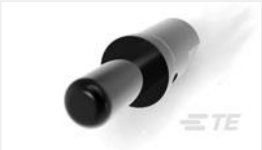
TE Part #1766283-1 CONTACT,PIN,#4,M5