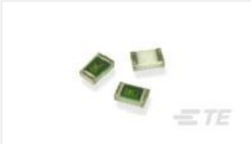
TE Part #1676143-2 RN 0805 100R 0.1% 10PPM 1KRL