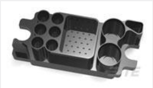
TE Part #1648152-1 241-28-01100