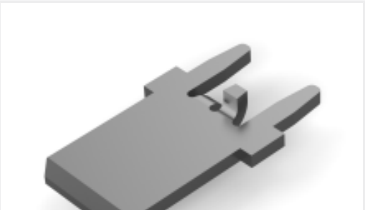
TE Part #1742188-1 250 FASTON,PCB TAB,TCBR