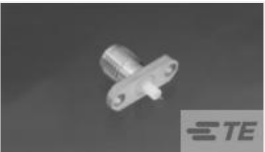
TE Part #1052902-1 2052 5674 02