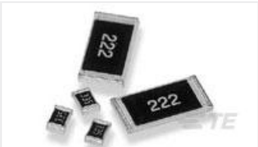
TE Part #1623095-1 CRG0805 1% 100K