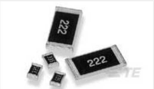
TE Part #1623107-1 CRG0805 1% 120R