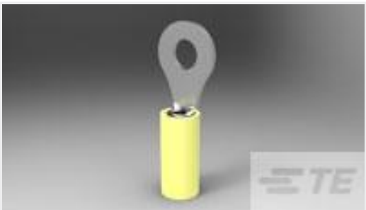
TE Part #326886 TERMINAL,PIDG R 12-10 6