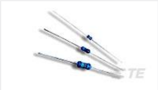
TE Part #2-1676914-7 YR1 0.1% 41K2