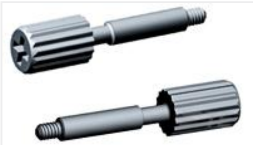
TE Part #748627-2 SHLD JACKSCREW,PLTD