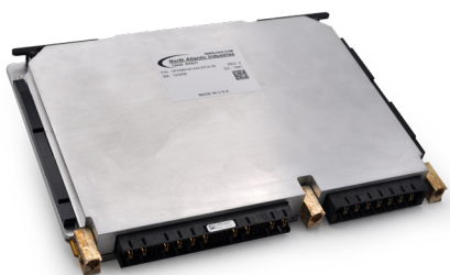
AC/DC & DC/DC Power Supplies