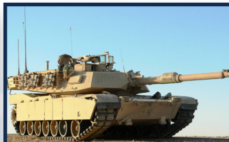
Abrams SEP V2/V3/V4 44KS5 VPX DC/AC Inverter