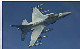
F-16 Wide Input Range VPX57-31 DC/DC PSU