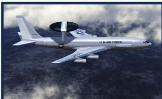
AWACS Radar System VPX55H DC/DC PSU