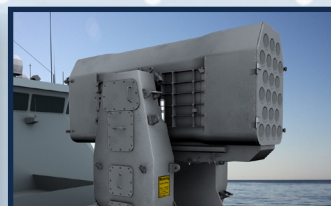
RAM Launcher (RIM-116) 56XS1, 2,000 Watt PSU