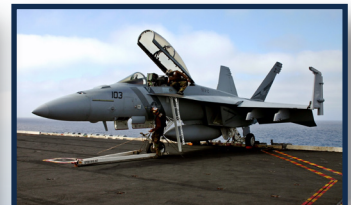
F-18 IRST VPX57-31 DC/DC PSU