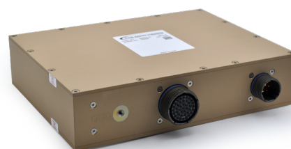
High Power LRU Standalone