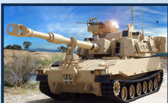
M109 Howitzer VPX68 DC/DC PSU