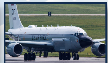
Compass Call 56XS1-028 2,000W LRU