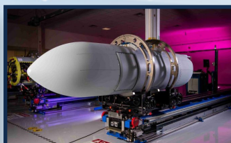
Next Generation Jammer VPX56H-6 AC/DC PSU