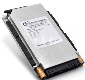
DC/DC Holdup Units